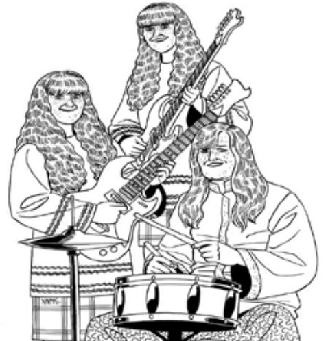
Better Than The Beatles? (“The Shaggs”, ca. 1970)

“Instru- & Experi- for the Cerebrally Suffixed”